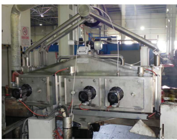
GlassChem HECSt 1800 hot end coating system has been developed specifically for high speed production lines.

In the case of standard bottle production, the vapour is distributed in the ambient area towards the annealing lehr entrance, with the risk of subsequent finish coating. For this special type of hood, the standard exhaust system is adjustable via flaps so that exhaust quantity (eg at hood entry) can be reduced, with the result of increased quantity by the extended exhaust system at the hood exit.