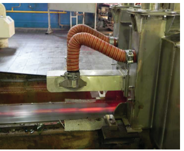
The HECSt 1800 exit exhaust.