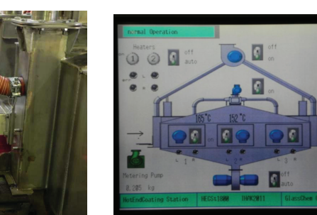
The system's user-friendly touch screen.

In alignment to the triple vapour loop system, an appropriate air stream is guided evenly to the bottle finish area. In this way, turbulence with the result of coating vapour in these finish areas - is avoided.