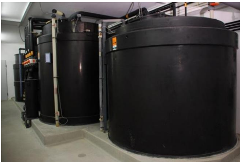
Neutra chemical storage tanks